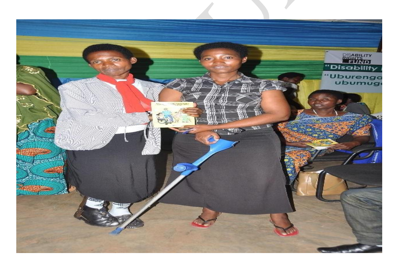
"Disability Women's Empowerment trainings"

HRFRA deepened its commitment to disability rights by integrating disability inclusion into all program areas. We amplified the voices of persons with disabilities—especially women and girls—and ensured their full participation in our legal empowerment efforts.