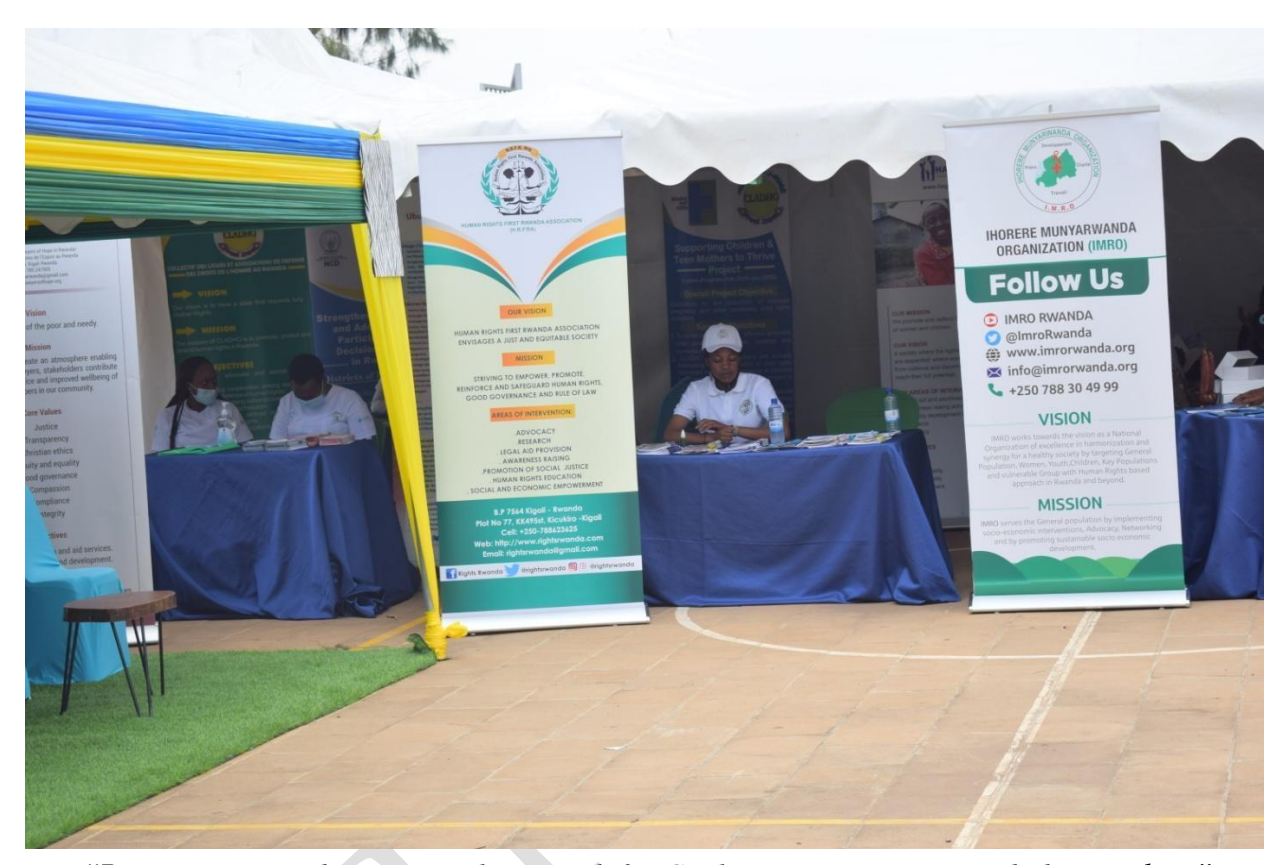
"Participating in the open week in Kigali for Civil society to interact with the populace"