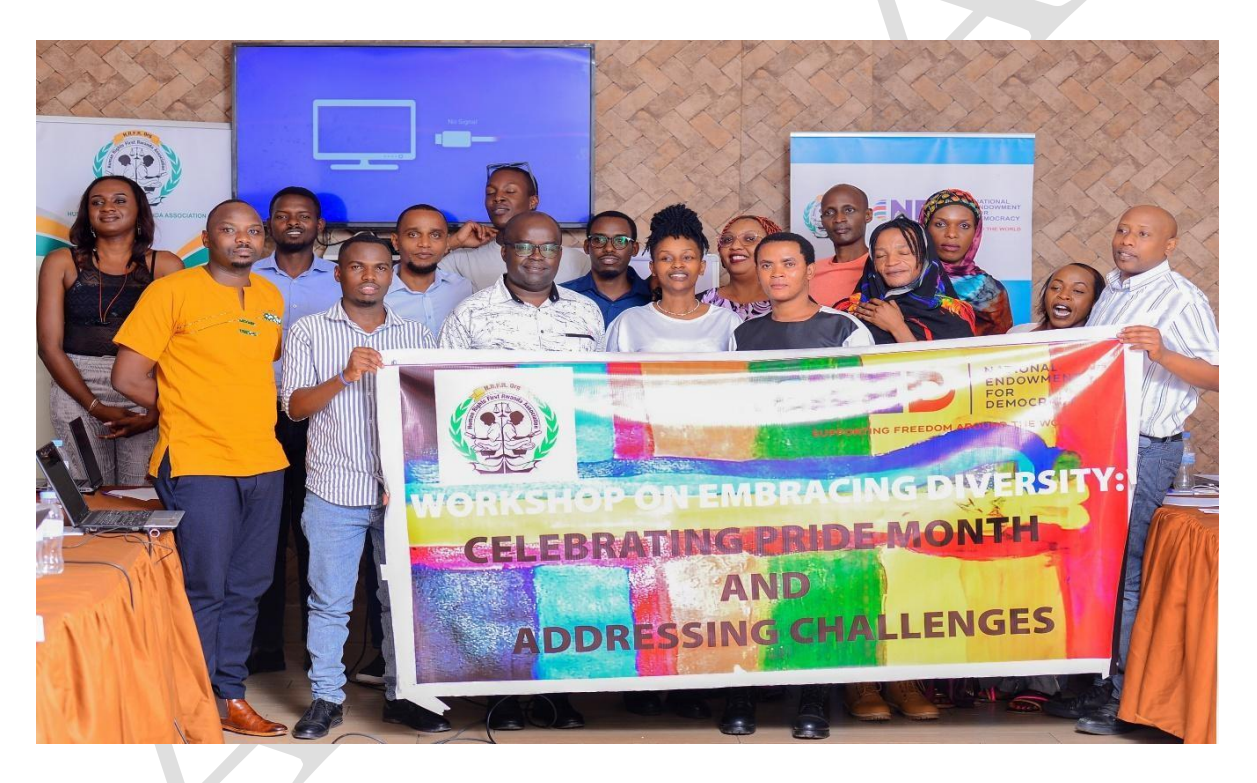
"LGBTIQ+ Leaders celebrating the Pride Month Workshop"

We also facilitated HIV awareness events for LGBTQI+ refugees , including World AIDS Day commemorations, to challenge health-related stigma and promote inclusive service delivery.