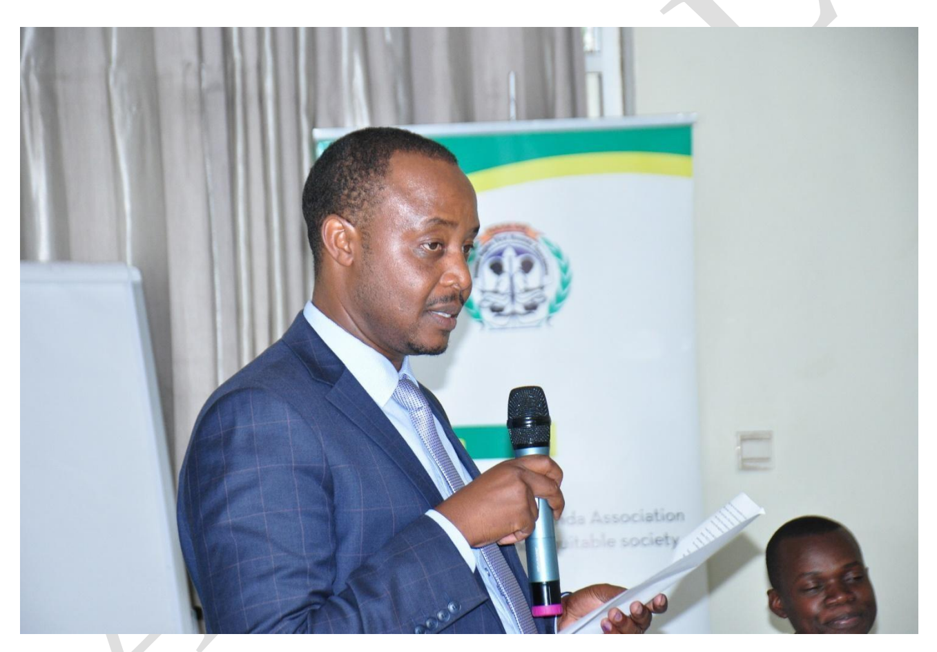
"Board member making a presentation during the Annual Assembly"